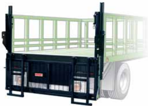
STANDARD FEATURE – Rearward Folding Rack for unobstructed access to rear of truck body on 42" (laden truck) or higher bed height trucks.