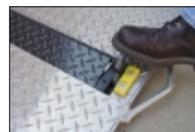
Pop-up cart stops

... plus all other Anthony quality features that help make Anthony the industry leader in innovative designs, performance, dependability, and value since 1941.