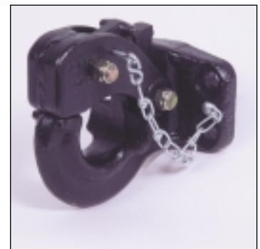
Heavy-duty pintle hook Sizes available: 5 ton Pintle Hook for ATU-669 Bracket 12 ton Pintle Hook for ATU-670 Bracket

Pintle hooks and combination hitches may be ordered together with the ATU-669 or ATU-670 Bracket or purchased separately. Contact your truck dealer, equipment distributor, or call Anthony Liftgates at 815-842-3383 for full details.