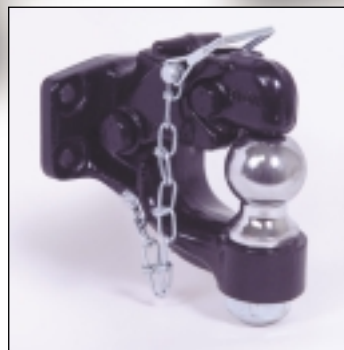
Steel combination hitch Sizes available: 5 ton Combo Hitch w / 1 7/8" ball for ATU-669 Bracket 5 ton Combo Hitch w / 2" ball for ATU-669 Bracket 5 ton Combo Hitch w / 2 5/16" ball for ATU-669 Bracket 8 ton Combo Hitch w / 2 5/16" ball for ATU-670 Bracket

To find out about other Anthony Liftgates products and options, check out our web site at www.anthonyliftgates.com