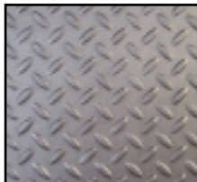
Platform surface is shot blasted to a "white metal" finish.