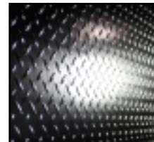
Attractive, impact-resistant finish

For more information about our finishing process or any of our quality liftgates, contact Anthony Customer Service: phone – (815) 842-3383, fax – (815) 844-3612, e-mail – sales@anthonyliftgates.com . Be sure to visit our website at www.anthonyliftgates.com to see what else is new at Anthony.